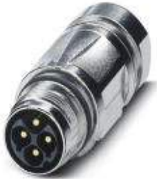
Coupler connector, straight, SPEEDCON locking, M17, Number of positions: 3+PE, Type of contact: Male connector, Crimp connection, shielded: yes, Cable diameter: 10 mm...12.5 mm

Please be informed that the data shown in this PDF Document is generated from our Online Catalog. Please find the complete data in the user's documentation. Our General Terms of Use for Downloads are valid ( http://phoenixcontact.com/download )