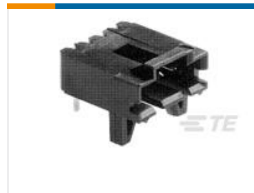
TE Part #5-103672-2 03 MTE HDR SRRA LATCH W/HLDWN