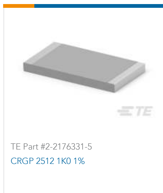
TE Part #2-2176331-5 CRGP 2512 1K0 1%