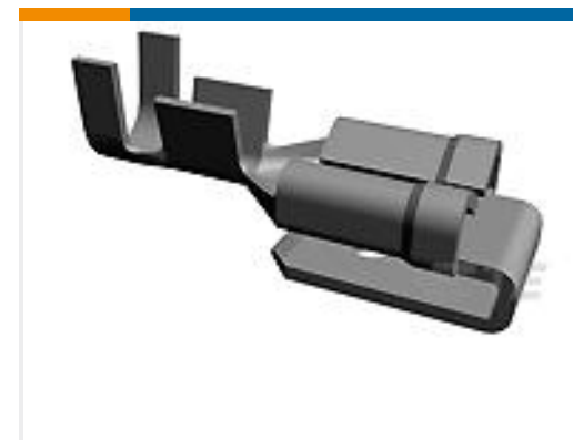
TE Part #1217151-1 187 FASTON,PIGGYBACK REC.,18-14 AWG,TPBR