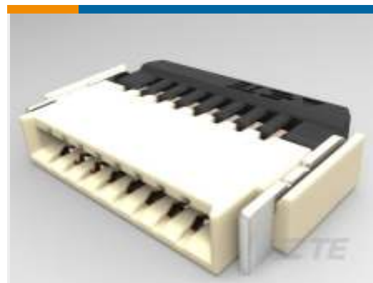
TE Part #2328702-6 6PIN 0.5MMP FPC CONNECTOR, BACK FLIP LOCK