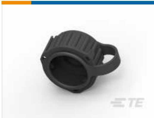
TE Part #965786-1 Circular DIN Backshells