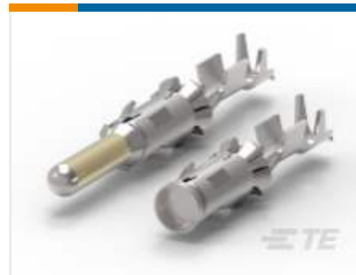
TE Part #929967-1 ROUND CONNECTOR SYSTEM, PIN AND SOCKET