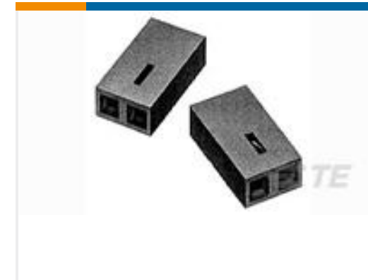
TE Part #530153-2 TDM SPRING SHUNT ASSY 2 POS