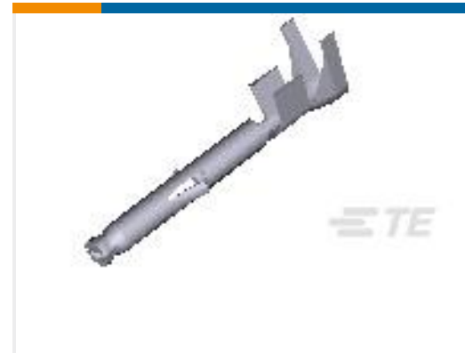
TE Part #770988-1 MINI UMNL SOK 22-18AWG SN LP