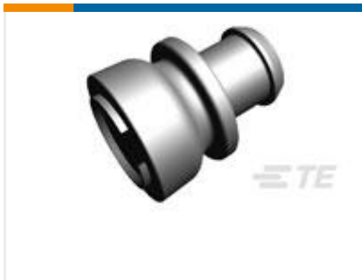
TE Part #828920-1 EINZELADERDICHTUNG