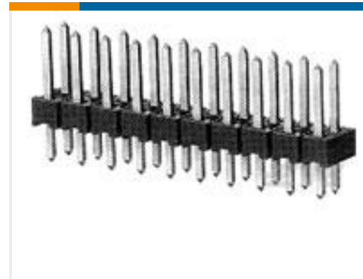
TE Part #5-146254-3 06 MODII HDR DRST B/A .100CL