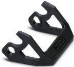
Replacement single locking latch for HEAVYCON EVO housing type B6, PA

Please be informed that the data shown in this PDF Document is generated from our Online Catalog. Please find the complete data in the user's documentation. Our General Terms of Use for Downloads are valid ( http://phoenixcontact.com/download )