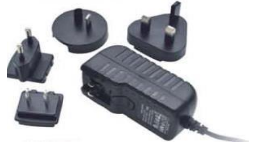
*Product images are for illustrative purposes only and may vary from actual design.