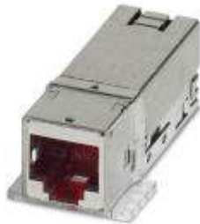
RJ45 female insert, for Freenet-System, CAT6<sub>A</sub>, 8-pos., shielded, with cable connection

Please be informed that the data shown in this PDF Document is generated from our Online Catalog. Please find the complete data in the user's documentation. Our General Terms of Use for Downloads are valid ( http://download.phoenixcontact.com )