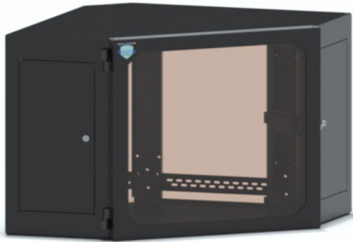
12U CORNER WALL MOUNT CABINET Item #:1915-3-700-12

Rethinking your room's workflow possibilities with one visionary design.