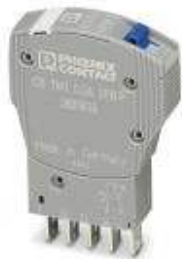
Thermomagnetic device circuit breaker, 1-pos., tripping characteristic SFB, 1 PDT contact, plug for base element.

Please be informed that the data shown in this PDF Document is generated from our Online Catalog. Please find the complete data in the user's documentation. Our General Terms of Use for Downloads are valid ( http://download.phoenixcontact.com )