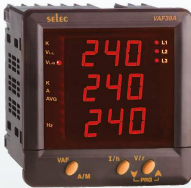
96 X 96mm