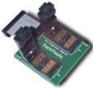
28Pin SOIC Programming Adapter #MP-SOIC28