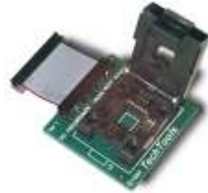
44Pin PLCC Programming Adapter #MP-PLCC44