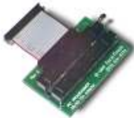
40Pin ZIF Programming Adapter #MP-ZIF40