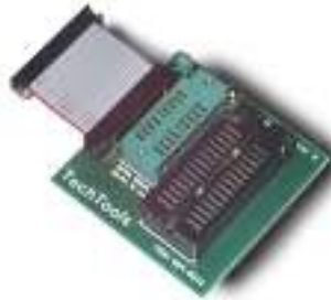
18Pin/28Pin ZIF Programming Adapter #MP-ZIF18/28