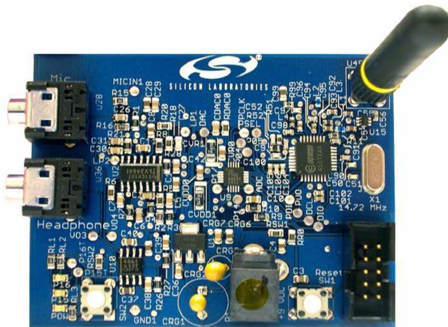
Figure 1. Wireless Voice Transceiver Board

Note: This design operates the RF transceiver at 908 MHz . This frequency can be modified in firmware. Silicon Labs' USB debug adapter and software tools are required to recompile the code and reprogram the boards.