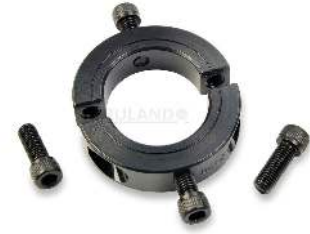
*Additional hardware NOT included