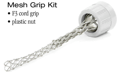
NON-METALLIC WIRE MESH GRIP