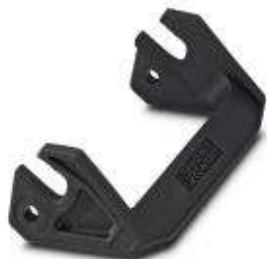
Single locking latch for B16 housing, HC-EVO....AL and HC-STA....AL

Please be informed that the data shown in this PDF Document is generated from our Online Catalog. Please find the complete data in the user's documentation. Our General Terms of Use for Downloads are valid ( http://phoenixcontact.com/download )