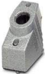
Powder-coated sleeve housing, with metric cable entry, locking screws with cylinder head

Please be informed that the data shown in this PDF Document is generated from our Online Catalog. Please find the complete data in the user's documentation. Our General Terms of Use for Downloads are valid ( http://phoenixcontact.com/download )