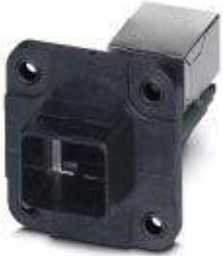
Panel mounting frame set, Degree of protection: IP65/67, Number of positions: 8, Material: Plastic

Please be informed that the data shown in this PDF Document is generated from our Online Catalog. Please find the complete data in the user's documentation. Our General Terms of Use for Downloads are valid ( http://phoenixcontact.com/download )