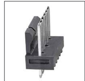
171857 Right-Angle Header