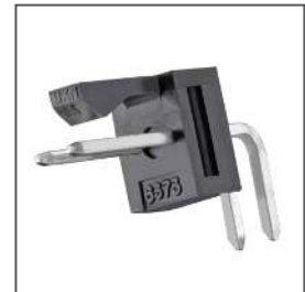
KK 254 RPC Vertical and Right-Angle Headers with Friction Lock