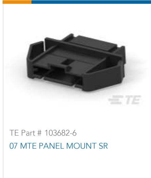
TE Part # 103682-6 07 MTE PANEL MOUNT SR