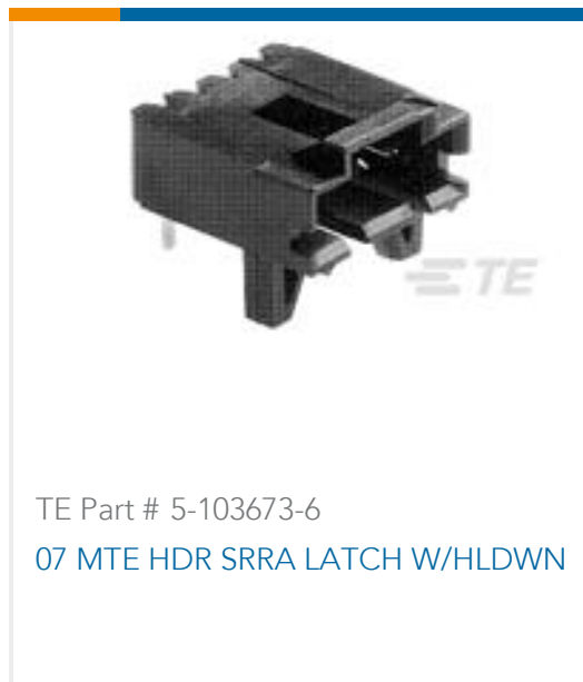
TE Part # 5-103673-6 07 MTE HDR SRRA LATCH W/HLDWN