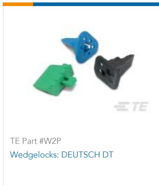
TE Part #W2P Wedgelocks: DEUTSCH DT