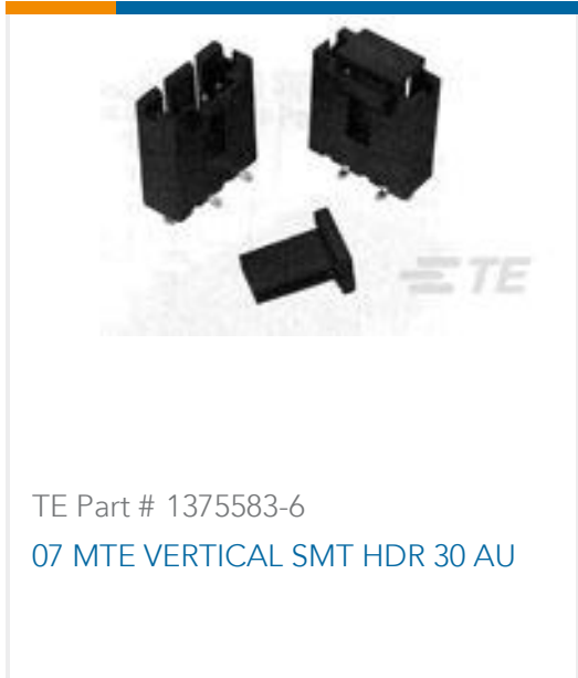
TE Part # 1375583-6 07 MTE VERTICAL SMT HDR 30 AU