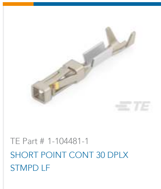
TE Part # 1-104481-1 SHORT POINT CONT 30 DPLX STMPD LF