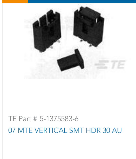
TE Part # 5-1375583-6 07 MTE VERTICAL SMT HDR 30 AU