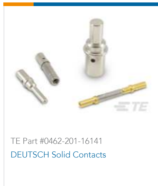
TE Part #0462-201-16141 DEUTSCH Solid Contacts