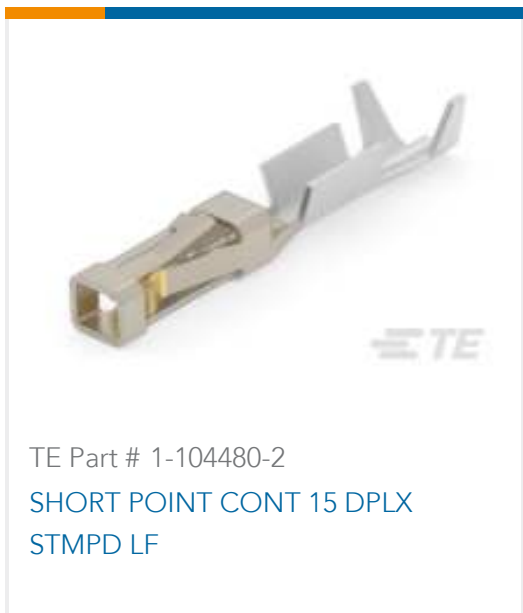
TE Part # 1-104480-2 SHORT POINT CONT 15 DPLX STMPD LF