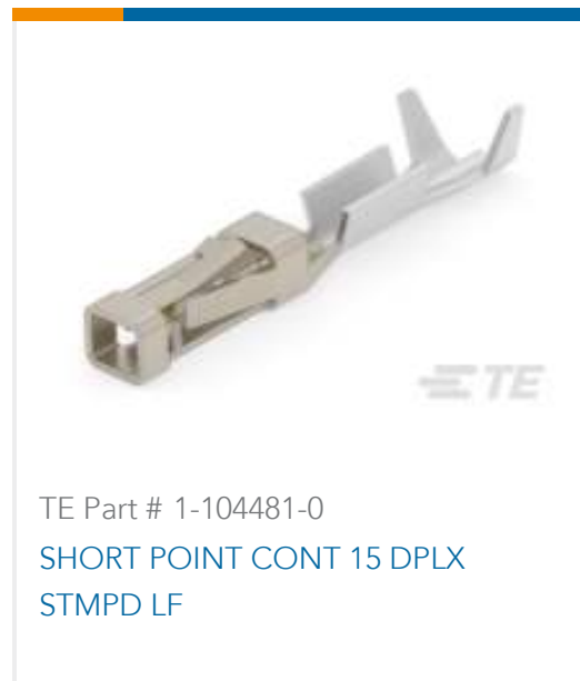
TE Part # 1-104481-0 SHORT POINT CONT 15 DPLX STMPD LF