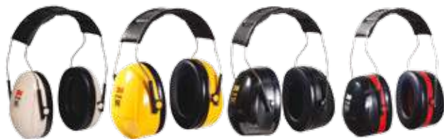
3M Peltor Optime Earmuffs: A market standard

3M Peltor Optime Earmuffs offer versatile protection that meets the needs of a majority of workplace applications.