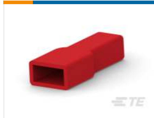
TE Part # 2-180930-1 250 FASTON HSG.,REC.,1 POS,RED