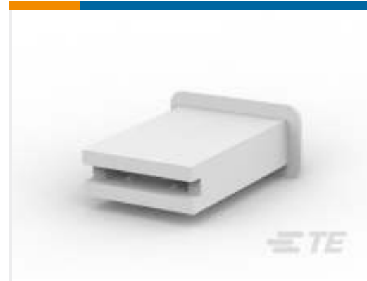
TE Part # 360041-1 187 FASTON HSG.,TAB,1 POS, NATURAL