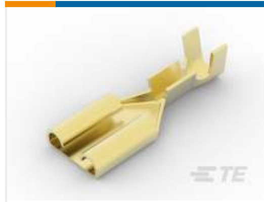
TE Part # 41771 250 FASTON REC 22-18 AWG BR