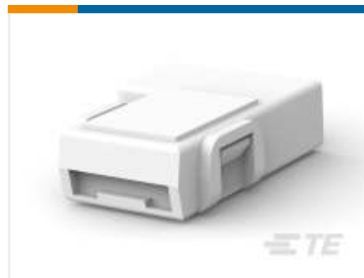
TE Part # 8-180984-2 250 FASTON BOOT FLAG REC. 1P NATURAL