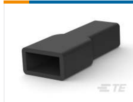
TE Part # 2-180930-5 250 FASTON HSG.,REC.,1 POS,BLACK