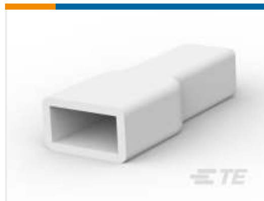
TE Part # 2-180930-0 250 FASTON HSG.,REC.,1 POS, NATURAL