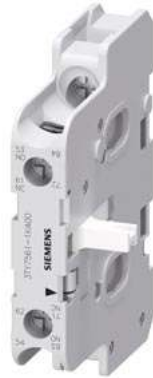
Auxiliary switch block, for size 3...12 2nd auxiliary switch block left or right