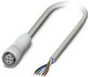
Sensor/Actuator cable, 5-position, PP-EPDM halogen-free, Gray RAL 7035. Free cable end, on Socket straight M12, A-coded, Cable length: 10 m, Hygienic design, with plastic knurl

Please be informed that the data shown in this PDF Document is generated from our Online Catalog. Please find the complete data in the user's documentation. Our General Terms of Use for Downloads are valid ( http://download.phoenixcontact.com )