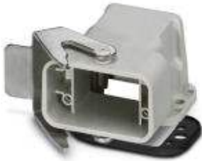
Panel mounting base with single locking engagement nose, angled design

Please be informed that the data shown in this PDF Document is generated from our Online Catalog. Please find the complete data in the user's documentation. Our General Terms of Use for Downloads are valid ( http://download.phoenixcontact.com )