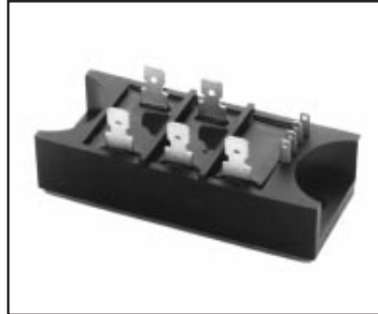
CE720802 Three-Phase SCR/Diode Bridge Modules 20 Amperes/800 Volts