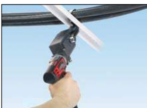
360° Rotating Head