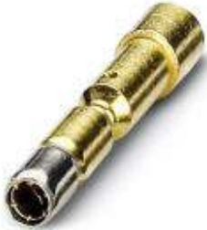
Crimp contact, Wire spring, Single contact, Contact diameter: 1 mm, Crimp range: 0.14 mm 2 ...1 mm 2

Please be informed that the data shown in this PDF Document is generated from our Online Catalog. Please find the complete data in the user's documentation. Our General Terms of Use for Downloads are valid ( http://download.phoenixcontact.com )