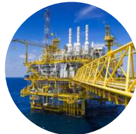
Upstream Oil and Gas