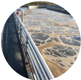
Waste Water Treatment