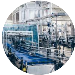
Industrial Water Systems