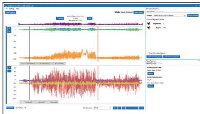
SensiML Data Capture Lab Screen