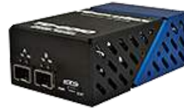
TD-6010 Throw-Down Workbox