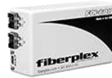
FOI-6010 Fiber Optic Isolator Transceiver Workbox

SFP module enclosure options If you need an enclosure to use with the SFPs, these FiberPlex products are available: