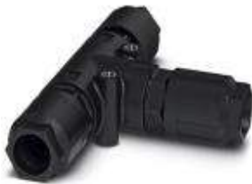
QUICKON T-distributor, black, 4+PE-pos., 2.5 mm 2 ... 6.0 mm 2 /690 V/40 A, for cable diameter of 12 mm ... 20 mm, with three QUICKON nuts

Please be informed that the data shown in this PDF Document is generated from our Online Catalog. Please find the complete data in the user's documentation. Our General Terms of Use for Downloads are valid ( http://phoenixcontact.com/download )