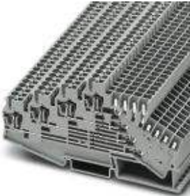
Multi-level terminal block, Connection method: Spring-cage/plug-in connection, Cross section: 0.08 mm 2 - 4 mm 2 , AWG: 28 - 12, Width: 5.2 mm, Color: gray, Mounting type: NS 35/7,5, NS 35/15

Please be informed that the data shown in this PDF Document is generated from our Online Catalog. Please find the complete data in the user's documentation. Our General Terms of Use for Downloads are valid ( http://download.phoenixcontact.com )