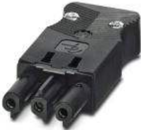
Socket for power supply and series connection, black, 3-pos.

Please be informed that the data shown in this PDF Document is generated from our Online Catalog. Please find the complete data in the user's documentation. Our General Terms of Use for Downloads are valid ( http://phoenixcontact.com/download )