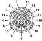
Connector pin assignment