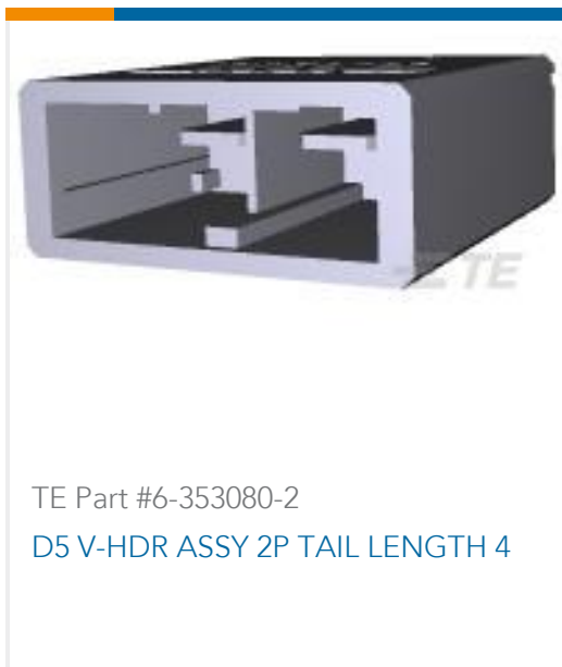
TE Part #6-353080-2 D5 V-HDR ASSY 2P TAIL LENGTH 4