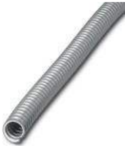
Protective hose, spring steel wire with PVC coating, highly stranded

Please be informed that the data shown in this PDF Document is generated from our Online Catalog. Please find the complete data in the user's documentation. Our General Terms of Use for Downloads are valid ( http://phoenixcontact.com/download )