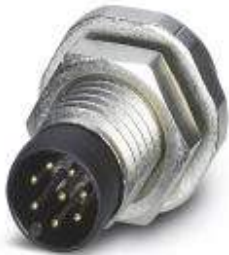
Sensor/actuator flush-type plug-in connector, plug, 8-pos., M8, rear/screw mounting with M8 fastening thread, with straight solder connection

Please be informed that the data shown in this PDF Document is generated from our Online Catalog. Please find the complete data in the user's documentation. Our General Terms of Use for Downloads are valid ( http://download.phoenixcontact.com )