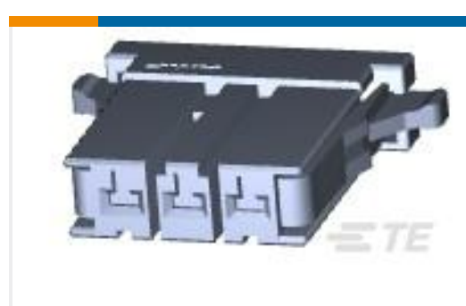
TE Part #3-178128-3 DYNAMIC D3200 REC HSG 3P SGL Z