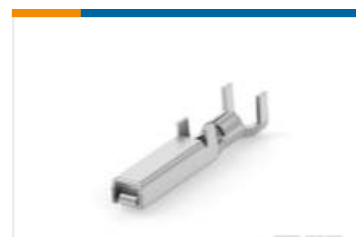
TE Part #1-175218-5 Contact: Component To Wire; 15A, 28-14 wire size