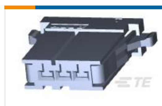
TE Part #1-178288-3 DYNAMIC DD3100 REC HSG 3P (SGL)