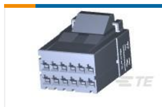
TE Part #1-1318118-6 DYNAMIC D-2100 REC HSG 12P