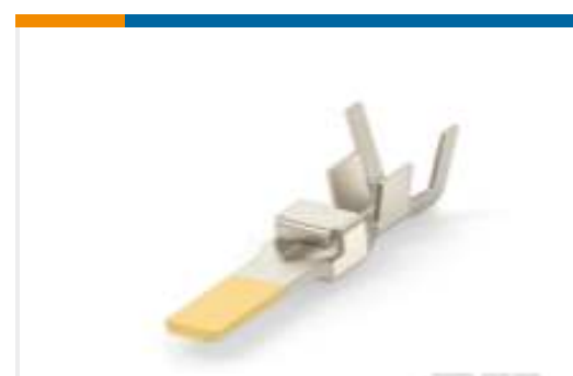
TE Part #316041-6 Contact: Component To Wire ; 20-45A · 20-8 wire size