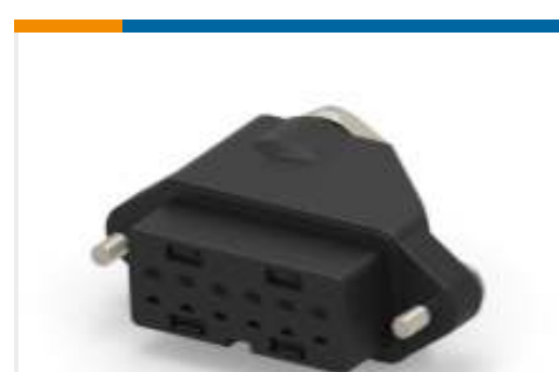
TE Part #2345834-2 NEW MOTOR CONN REC KIT. PF