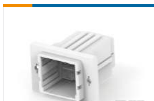
TE Part #2-917807-2 Receptacle and Tab Housing: 5.08 or 10.16 mm pitch, 250-600V