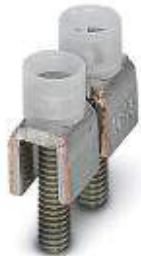
Fixed bridge, Number of positions: 2, Color: silver

Please be informed that the data shown in this PDF Document is generated from our Online Catalog. Please find the complete data in the user's documentation. Our General Terms of Use for Downloads are valid ( http://download.phoenixcontact.com )