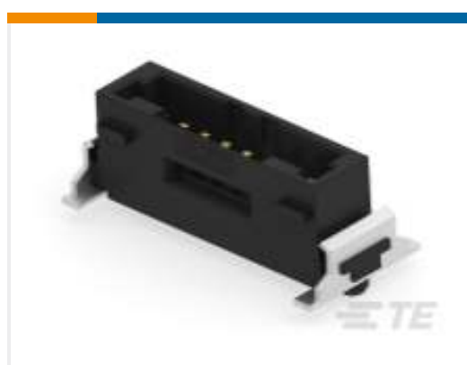
TE Part #474818-E SRCP 1,27 8 M 1-KS SMD 137 E1 094 * GU-H