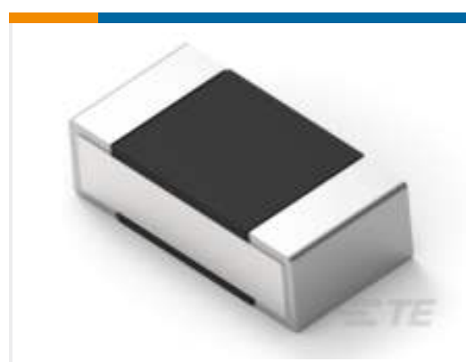
TE Part #9-2176305-4 RP 1E 0.1W 1K0 0.1% 25PPM 5K RL