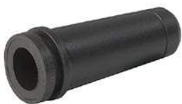
HN 14.40 PVC Strain Relief