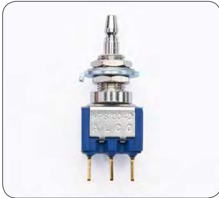
SPDT PCB Gold