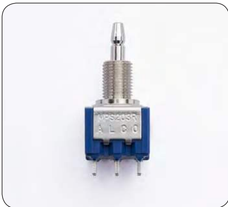
DPDT Wire Lug Silver