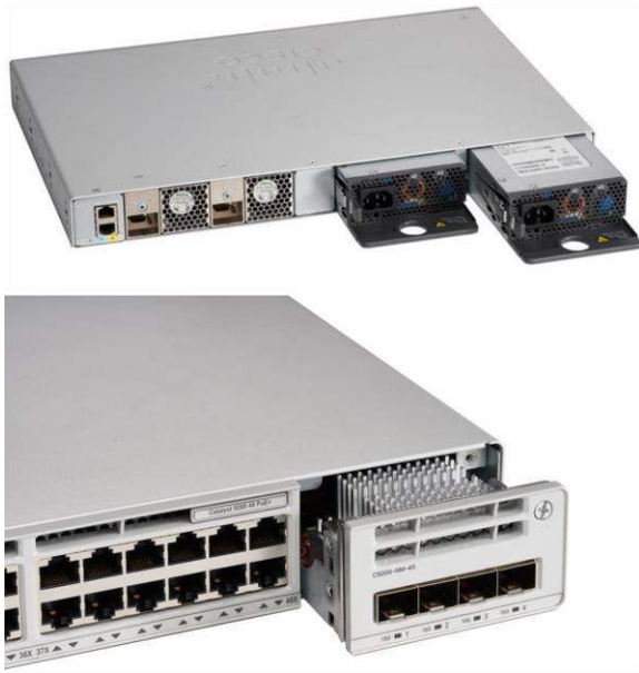
Figure 3. Cisco Catalyst 9200 Series Switch dual redundant power supplies

Table 4 lists the PoE power availability for each model.