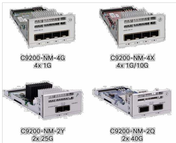
Figure 2. Cisco Catalyst 9200 Series Switch network modules

Cisco Catalyst 9200 Series switches come with modular or fixed uplinks as indicated in Table 1. With modular SKUs, the field-replaceable network modules provide infrastructure investment protection by allowing a nondisruptive migration from 1G to 10G and beyond. When you purchase the switch, you can choose from the network modules described in Table 3.