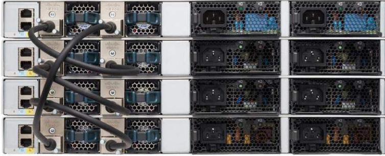
Figure 4. Cisco Catalyst 9200 Series Switch stacked units