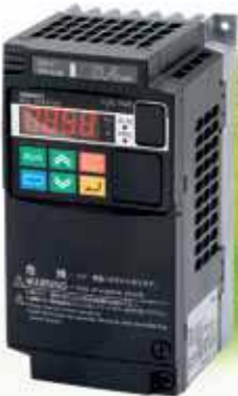
AC Drive Option