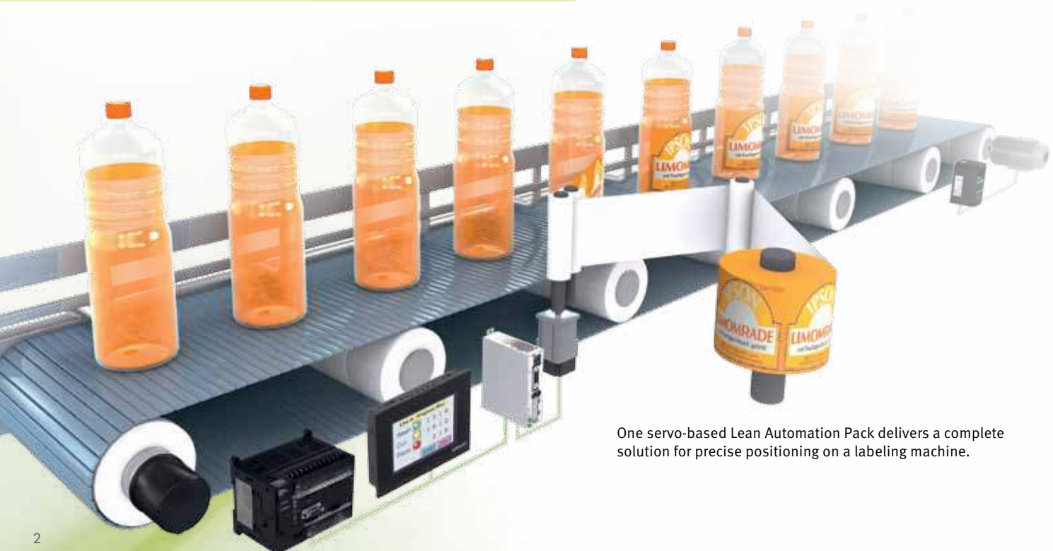
One servo-based Lean Automation Pack delivers a complete solution for precise positioning on a labeling machine.