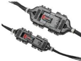
MultiCat Mid-Power Connector System