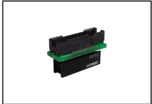
Figure 1 External View of the R0E000200CKA00