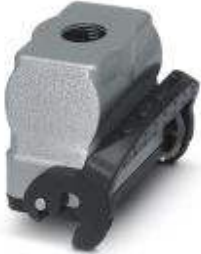
HEAVYCON B6 coupling housing, with single locking latch, height: 77.5 mm, with 1 x M25 thread, straight cable outlet

Please be informed that the data shown in this PDF Document is generated from our Online Catalog. Please find the complete data in the user's documentation. Our General Terms of Use for Downloads are valid ( http://phoenixcontact.com/download )