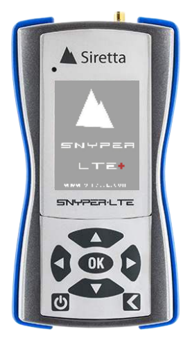
* Neither SNYPER-LTE+ (USA) V1 nor SNYPER-LTE+ (USA) V2 require a SIM in order to function.

4G/LTE & 3G/UMTS Network Signal Analyser