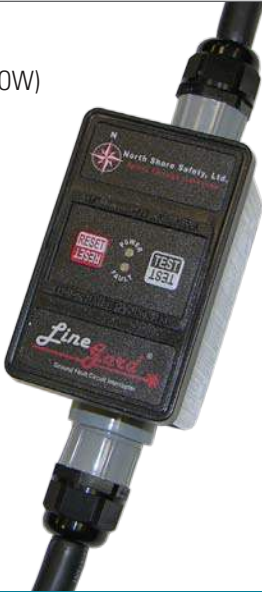
Flying Leads (SE00W)