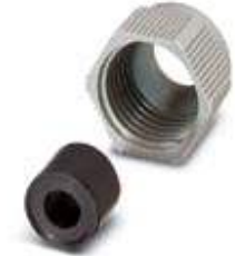
D-SUB cap nut with line seal, for sleeve housing VS-09-..., conductor diameter of 5 mm ... 9 mm

Please be informed that the data shown in this PDF Document is generated from our Online Catalog. Please find the complete data in the user's documentation. Our General Terms of Use for Downloads are valid ( http://download.phoenixcontact.com )