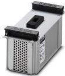
Test adapter for COMTRAB-CTM

Please be informed that the data shown in this PDF Document is generated from our Online Catalog. Please find the complete data in the user's documentation. Our General Terms of Use for Downloads are valid ( http://download.phoenixcontact.com )